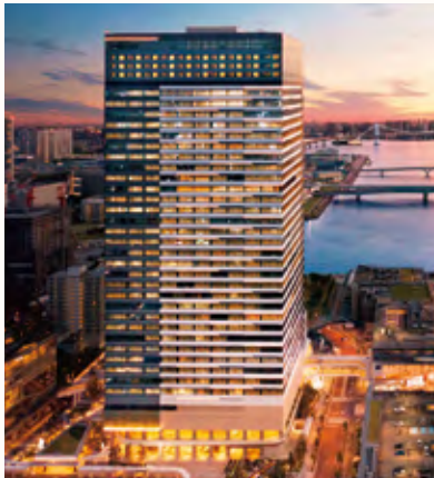
Mitsui Garden Hotel Toyosu PREMIER

Our hotel offers excellent access to Tokyo by being directly connected to Toyosu Station.