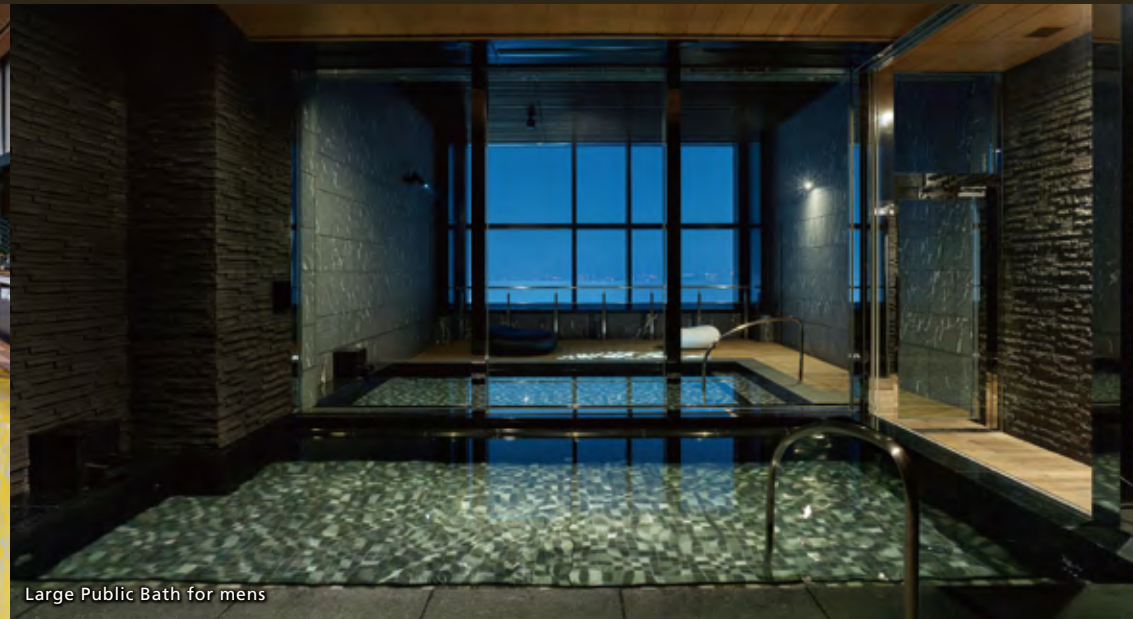
Large Public Bath for mens