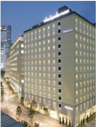
Mitsui Garden Hotel Shiodome Italia-gai

A sophisticated hideaway hotel, offers an Italian ambiance while having a sense of fun escape from the hustle and bustle of the city.