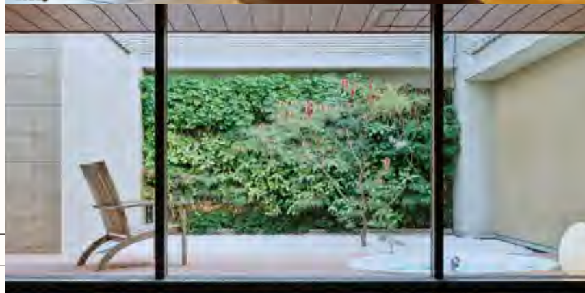
Large public Bath