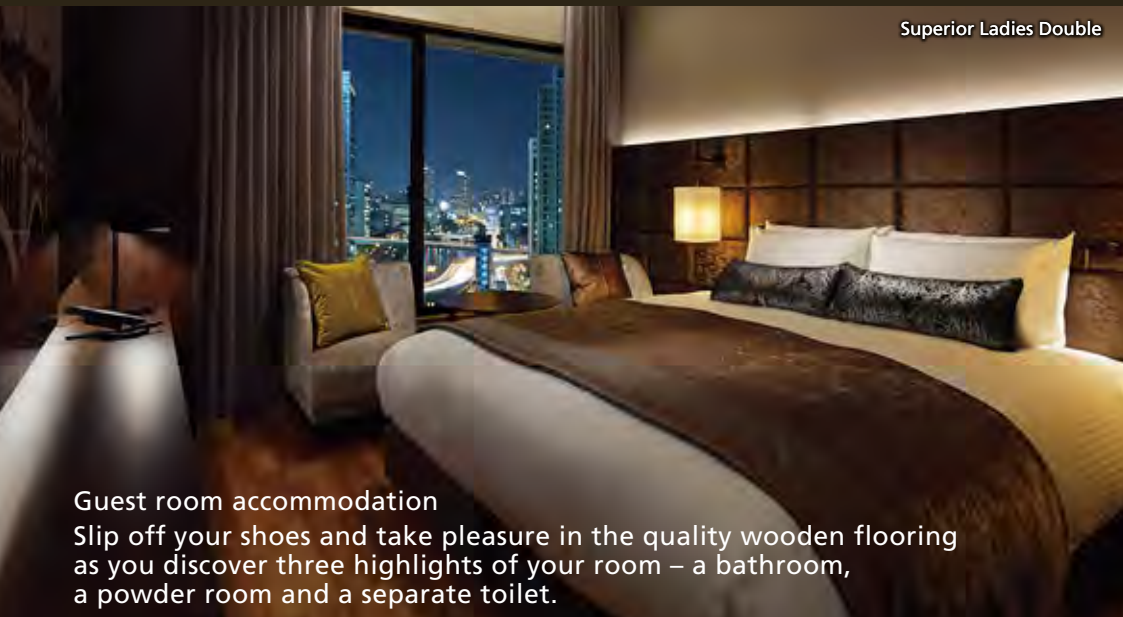
Superior Ladies Double