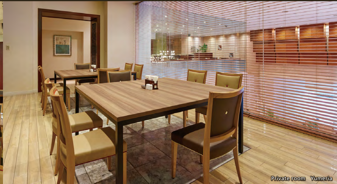
Private room Yumeria