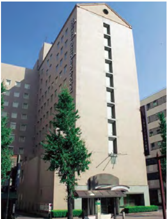
Mitsui Garden Hotel Kumamoto

Gently close your eyes and find peace of mind. It will evoke moments and conversations in similar surroundings.