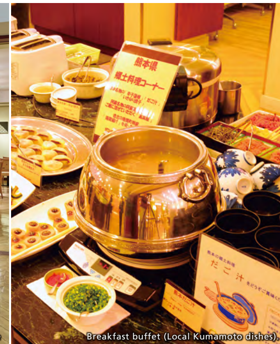
Breakfast buffet (Local Kumamoto dishes).